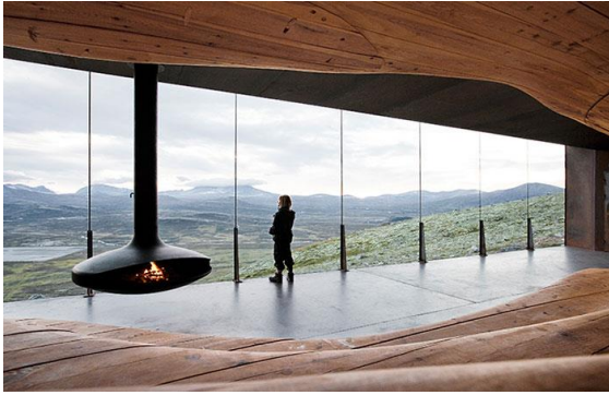
Trollstigen mountain pass